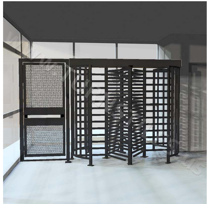
Tandem Turnstile with 36" ADA gate (sold separately)