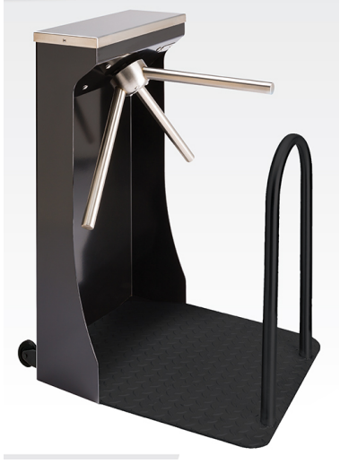
Matching BR5500-P Portable Turnstile

Units are warranted against defects in materials and workmanship for a period of one year from date of delivery. See warranty information for specific details.