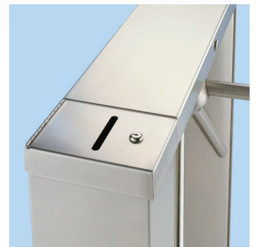
FP500-T (ticket box)