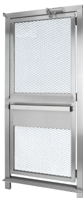
HS336 - Back (stainless steel with optional mesh push bar)

* Dimensions are subject to change without notice