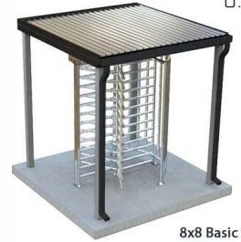
8x8 Basic Canopy w/Single Turnstile