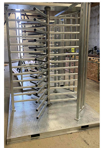
Outlaw Industries Portable Turnstile Bases with Full Height Single Turnstiles and ADA Gates