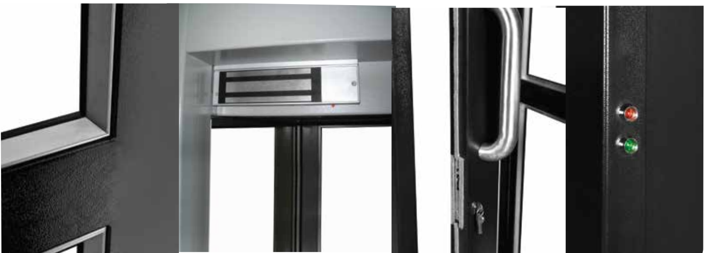
Welded steel frame with aluminium and glass infill