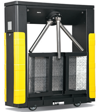
CatRax Portable ready for transportation