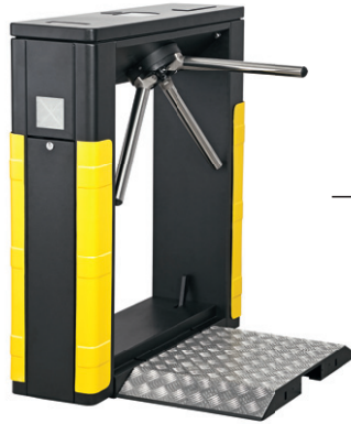
CatRax Portable operating

CatRax Show Portable turnstile is specially designed for security and flexibility. It has a wide passage for ease of use, collapsible base with wheels for portability. These units are the ideal turnstile solution for medium or large-sized events.