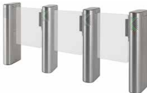
4-tower, 3-door configuration option

900mm wide passage, suitable for people with special needs. 2 closing modules.