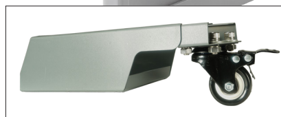
Optional casters ensures easy mobility