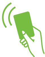
Access Control System

As a state-of-the-art optical turnstile, OP1000 maintains a high security level as a half-height turnstile. It replaces the traditional physical barriers by utilizing active infrared beams to create an invisible electronic field between two pedestals. If there are any unauthorized entry attempts, audible alarm will be triggered to alert security staff.