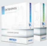
EntraPass CE, GE