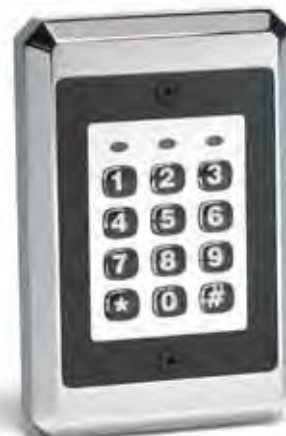
212iLW / 242iLW / SSW-iLW