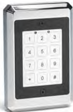
232FX / SSW-FX