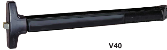
V40 (711 Finish)

Standard V40 Rim Device accommodates wide stile doors, 4" or greater stile, and flush doors. For Narrow Stile doors, 2" to 2 1/2" stiles, specify V40xNS model which provides a 2" longer device and a lower profile strike.