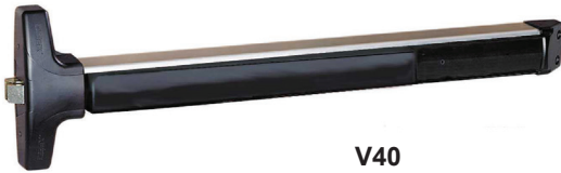
V40 (628 Finish)

The V40 Series rim exit device is secure and durable panic and fire exit hardware at an economical price. It is designed for use on all types of single and double doors with mullions. The patented mounting plate and strike locator system ensures the easiest and most accurate installation of panic hardware available.