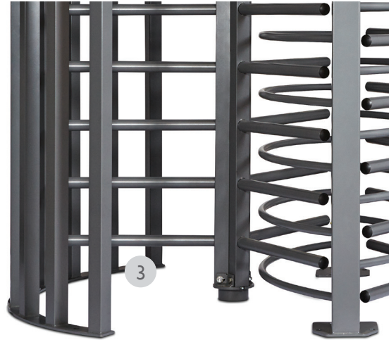
Rubberized bottom arm (3), provides impact protection to the user.

Arms in stainless steel at the point where users touch the equipment.