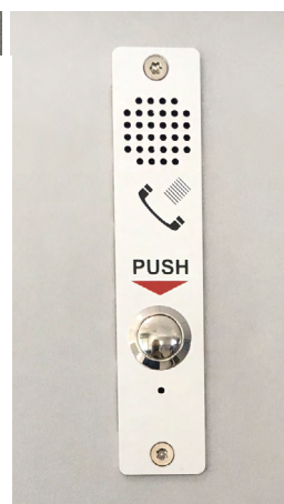
EXTERNAL SIDE PUSHBUTTON, TRAFFIC LIGHTS & INTERCOM