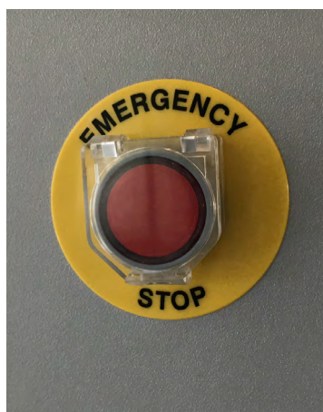
INTERNAL EMERGENCY PUSHBUTTON