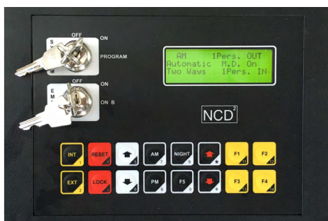
COMMAND & SETTING CONSOLE