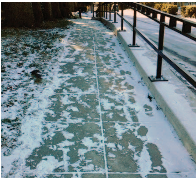
Oakville, Ontario, Canada