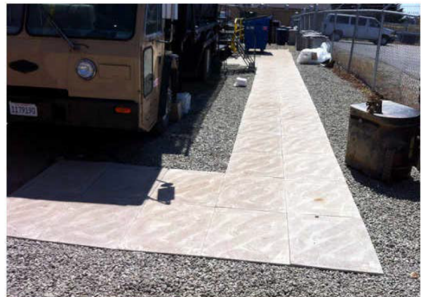
University of Santa Cruz, California