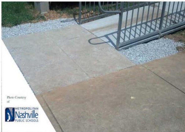
Metropolitan Nashville Public Schools, Nashville, Tennessee