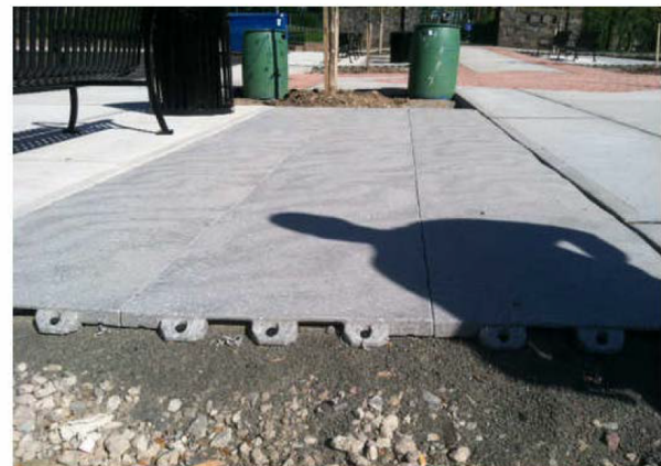
Braddock Park, North Bergen, New Jersey