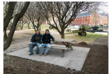
Fallen Warriors Memorial, Fort Douglas Campus, University of Utah, Salt Lake City, Utah