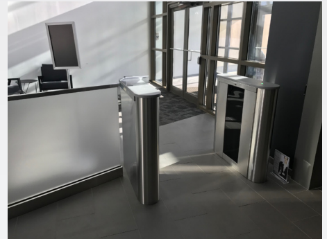
(BE800-R with Primary & Secondary Cabinet)