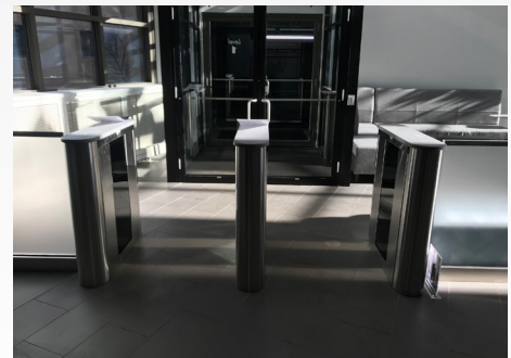
(BE800-R with Primary, Hybrid & Secondary Cabinet)