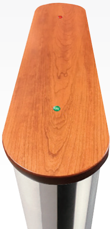
Optional wood top upgrade shown with lights