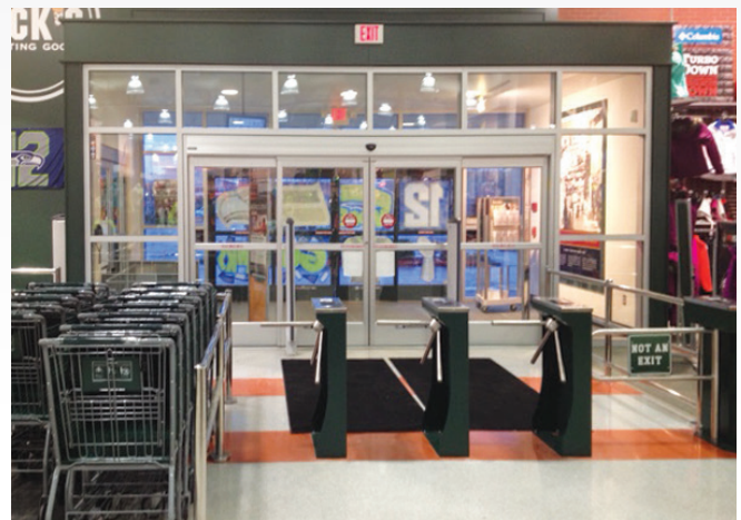
BR5500-S (tripod style arm) with custom BR5500-ADA Swing Gate