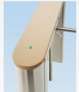
PTR Round-end with Corian®/wood*