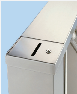
Optional ticket box

The PassThru™ Series is ideal in demanding situations where you want a more open, stylish look. It is made for years of reliable service in high traffic/volume applications. The cabinets are constructed of heavy 14-gauge, 300 series satin stainless steel and features our 6500 Series Control Head (with auto indexing and shock suppression technology). This unit features our longest turnstile arm.