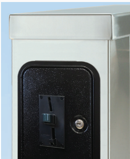
Optional coin box