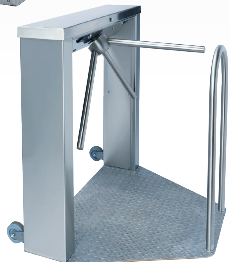
PTS-P with custom angled base plate