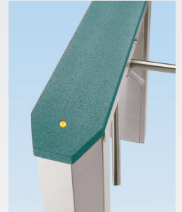
PTZ Trapezoid-end with Corian®/wood*