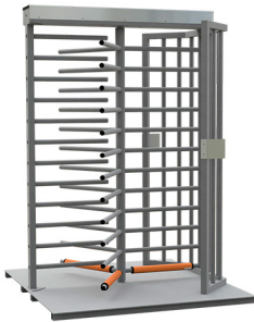
30" Passage Single Turnstile on Portable Base

TURNSTILES.us can provide complete portable turnstile systems pre-mounted to the base platform, or portable bases separately for field installation onto existing equipment.